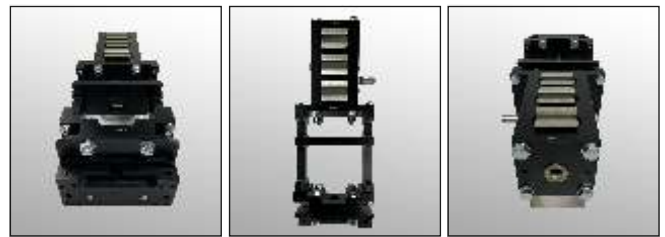
2) A simple 3-wipe system with a liquid cleaning and drying stages with a liquid pump to "wash" the wire and recycle the liquid from a large container and then dry it with an air-wipe.

For AIM customers only; includes the bracket to the AIM straighteners. The wipes are available for most standard wire sizes or can easily be made by to fit custom wire sizes on your own. Simple and quick Installation!!