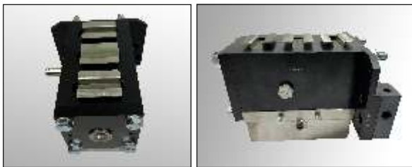
1) A simple 3-wipe system