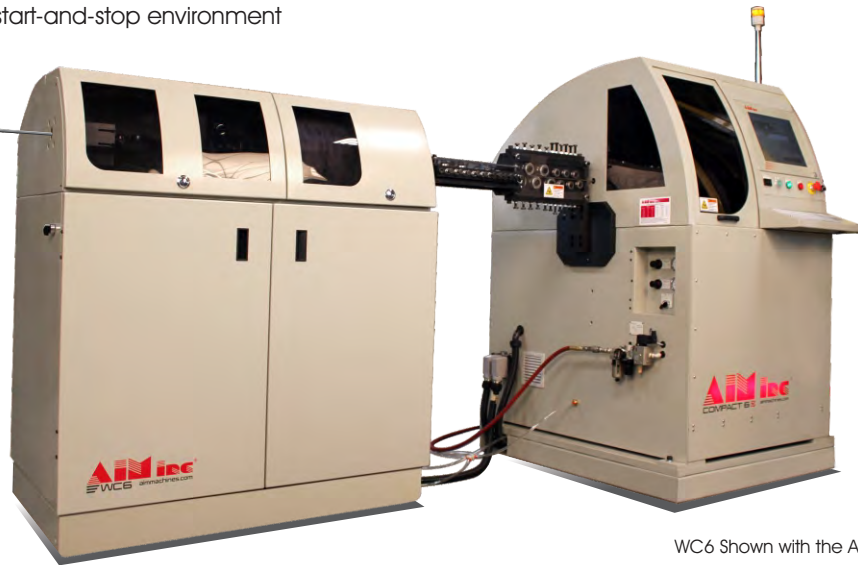
WC6 Shown with the AFC6D 3D Wire Bender.