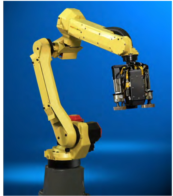
M-10iA Fab Metal Material Handling

Automated Industrial Machinery, Inc. ©2012 The Manufacturer Reserves the right to alter any data and/or photos provided in this brochure without notice.